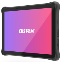
93DHN015900L33 RUGGED TABLET T-RANGER 10.1" ANDR 11 US

Via Berettine, 2 - 43010 Fontevivo PR - VAT: IT02498250345 - TEL: +39 0521 680111 - FAX: +39 0521 610701 - UNIQUE CODE: 8RQN7AZ